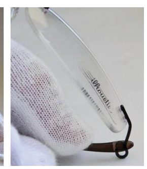
1. Place temple on a safe table surface and press temple into Snap-Hinge

NOTE: Clean hinge before assembling temple and cover with Teflon Precision Lubricant (P 0030 00 0000 0000) on the inside of the curve of hook