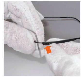
Hold lens fixation Adjust temple opening angle by hand in the hinge area