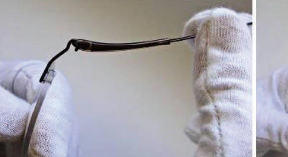
E. Turn temple 180-degrees and loosen from hook.